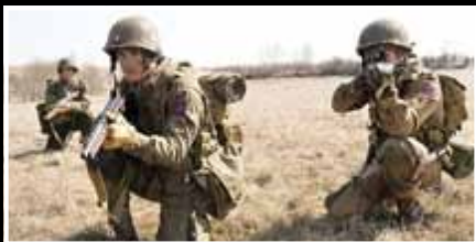
OFF TARGET: Spooky soldier tale misses badly