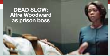
DEAD SLOW: Alfre Woodward as prison boss