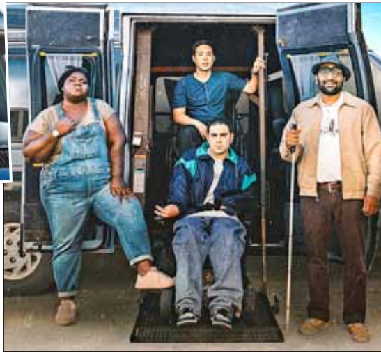
ALL ABOARD: Trio of unlikely heroes and their laconic driver

knows when to let the scenes run. I bet there was a lot of improv as the lead actors spark off each other.